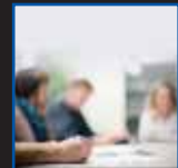
Ghost From The Past